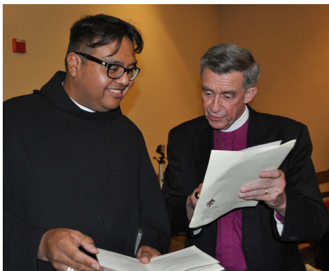
Bp. Paul Hewett, Diocese of the Holy Cross